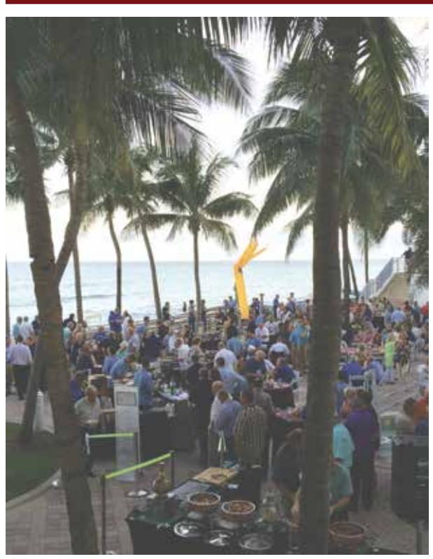
The Connect '15 Opening Reception was held poolside and oceanside.